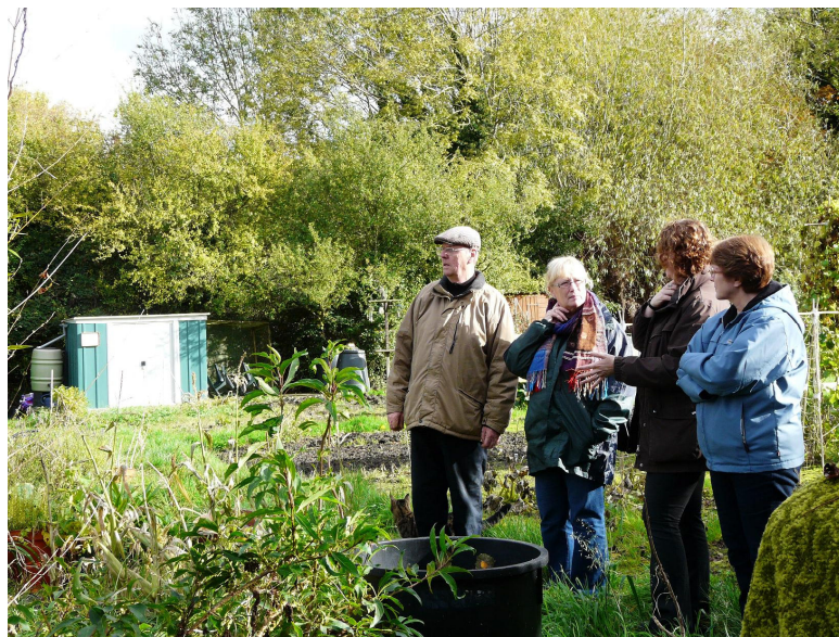
Site visit to Warden Hill Allotments

Recommendation 8 : To review the information about what commitment is required by taking on an allotment on the Council's website and include links to the Allotments Association website and investigate opportunities to introduce online notice and discussion boards