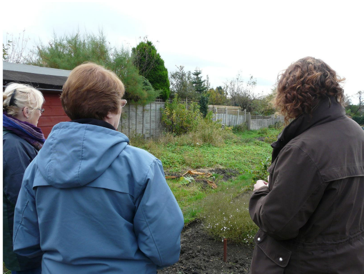
Site visit to Alma Road allotments