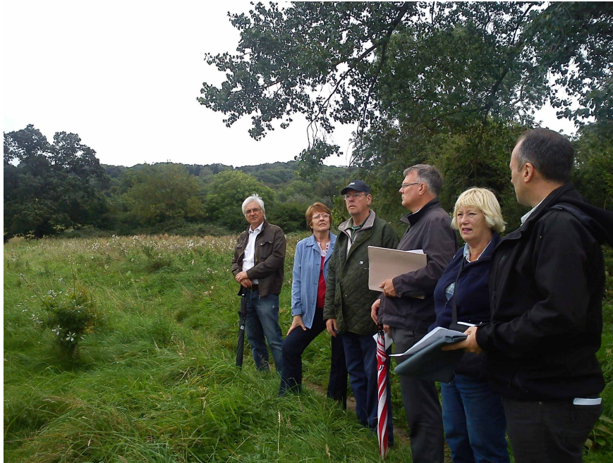
Site visit to farmland at Priors Farm

Recommendation 2 : Request Cabinet to pursue the development into allotments of a small part of the farmland owned by the Borough Council at Priors Farm to the north of the borough, not affecting any rights of way