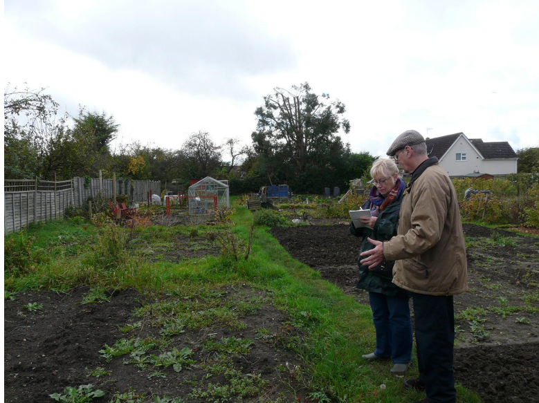
Site visit to Alma Road allotments

month from the date of the letter to start working the plot. The wardens inspect again after one month and if there still has been no action then a Notice to Quit (NTQ) is issued by the Allotments Officer. In principal this system should take less than 3 months from start to finish. In practice plotholders start working their plots after receiving the NTR which means no further action is taken. Wardens do however closely monitor repeat offenders and only so many chances are given before a NTQ is finally issued.