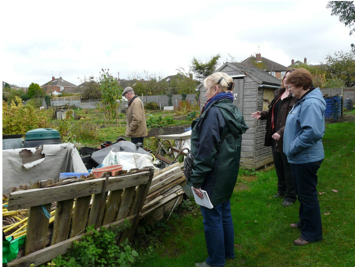
Site visit to Alma Road allotments